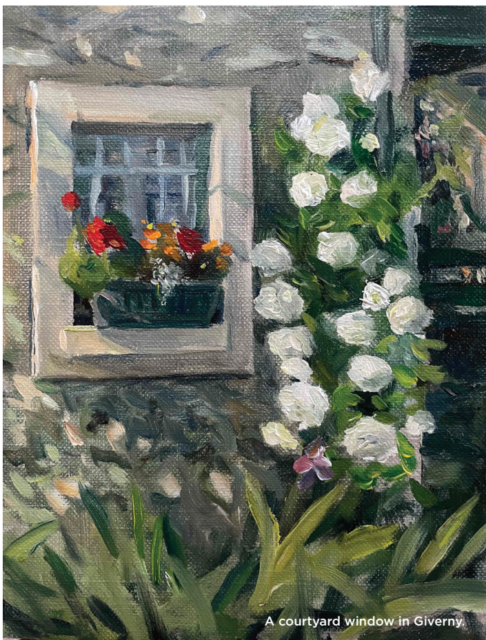
A courtyard window in Giverny.