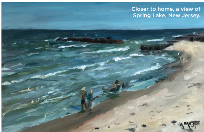
Closer to home, a view of Spring Lake, New Jersey.