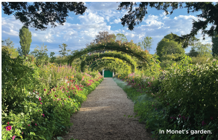
In Monet's garden.